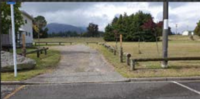
PAVILION CAR PARK & EMERGENCY ENTRANCE