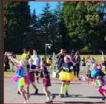
Teams supporting our annual fluoro fun day